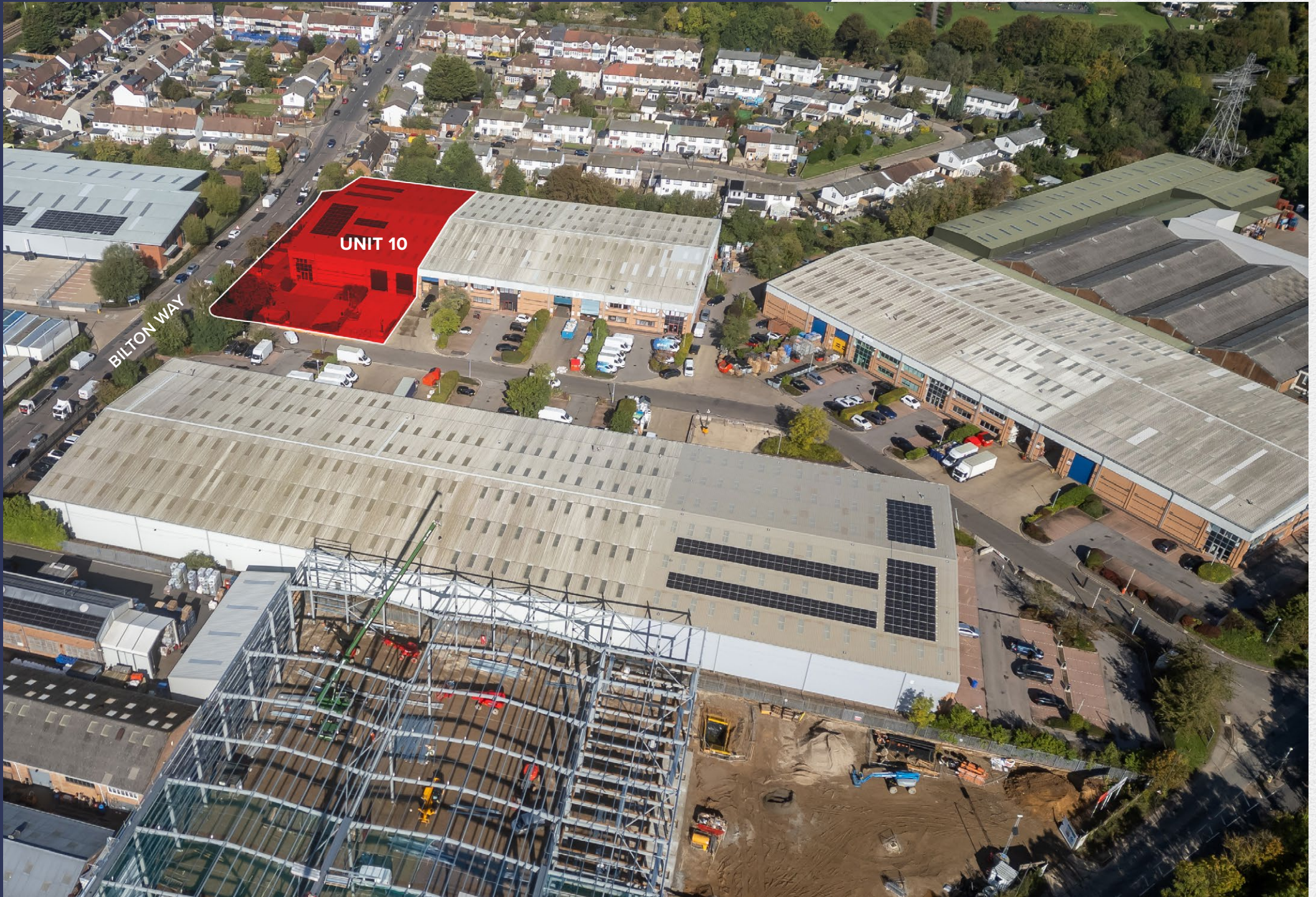
UNIT 10 // THE ARENA // ENFIELD // EN3 7NL