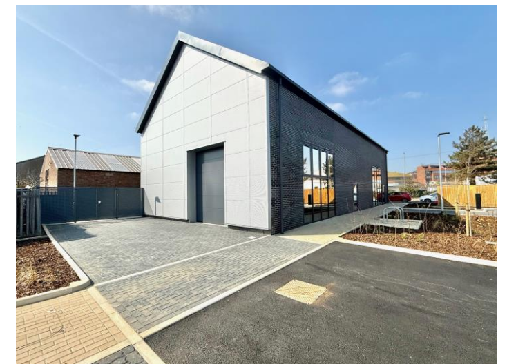
UNITS 15 & 16