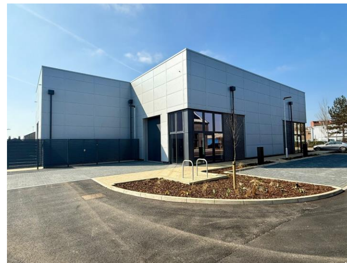
UNITS 4 & 5