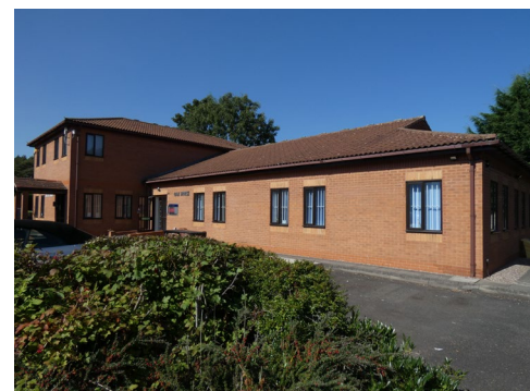
Beech and Oak House