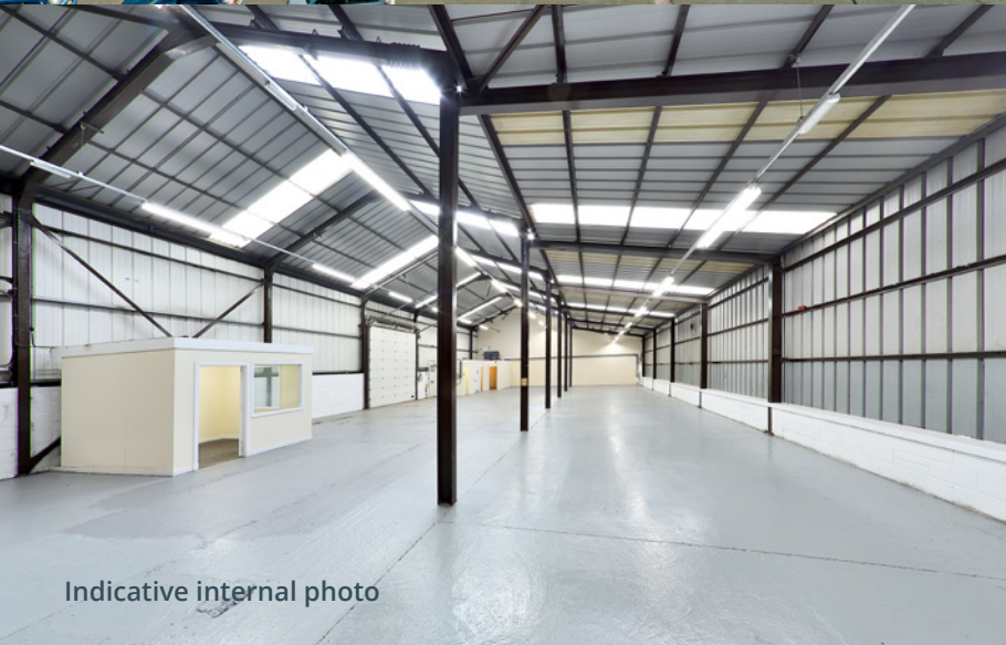
Indicative internal photo