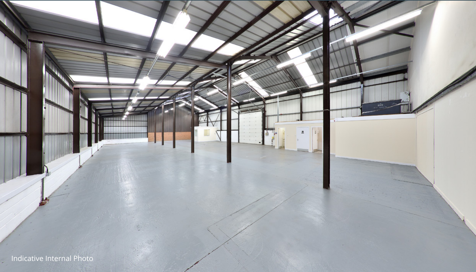
Indicative Internal Photo