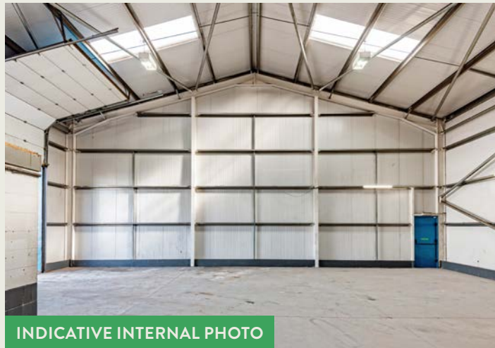
INDICATIVE INTERNAL PHOTO