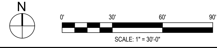
CONCEPTUAL SITE PLAN - 17 SCALE: 1" = 30'-0"