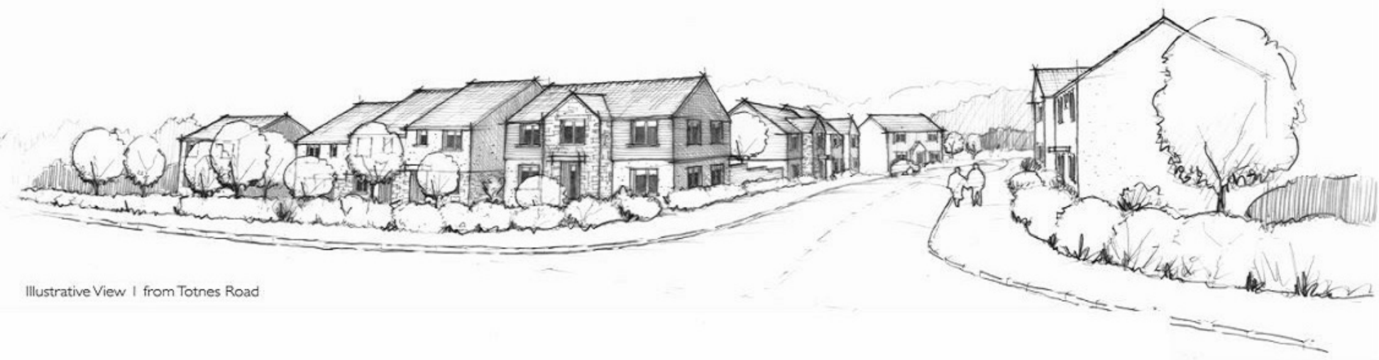
Illustrative View 1 from Totnes Road