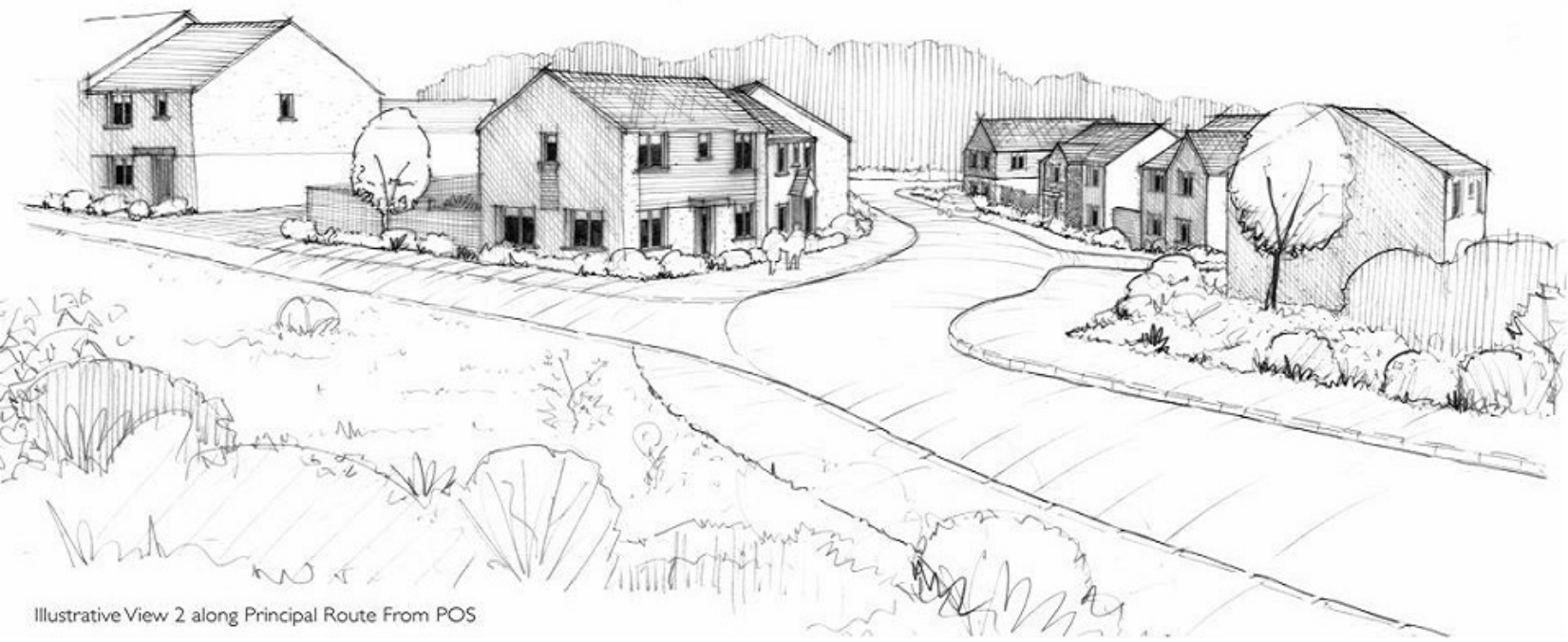
Illustrative View 2 along Principal Route From POS