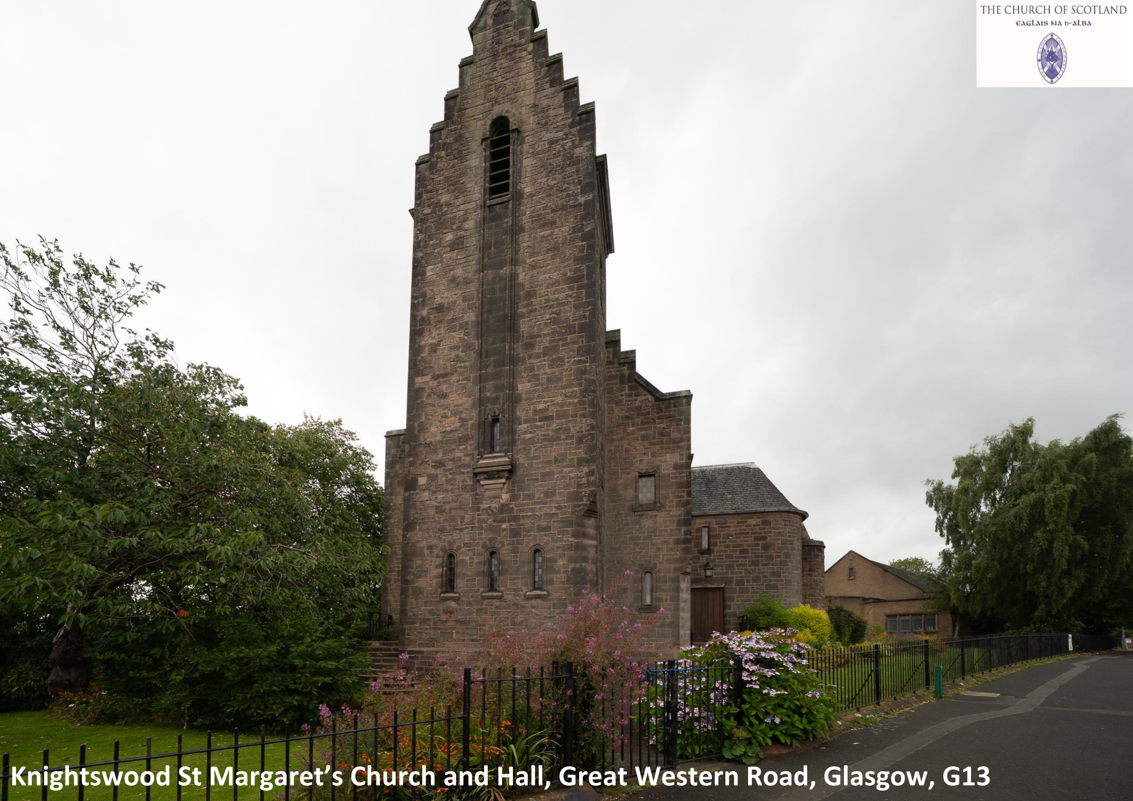
Knightswood St Margaret's Church and Hall, Great Western Road, Glasgow, G13