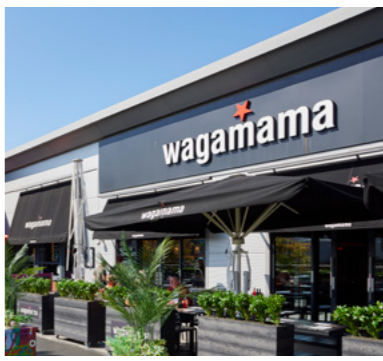
Wagamama Wagamama serves vibrant, Asian-inspired dishes in a relaxed, modern setting, perfect for satisfying every craving. IG: @wagamama_UK