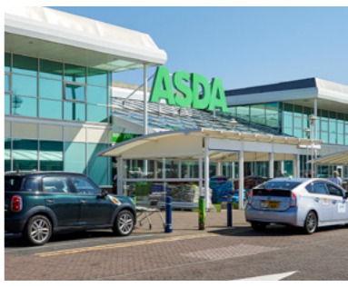
ASDA ASDA brings great value to everyday shopping, from fresh produce to household essentials at unbeatable prices. IG: @asda