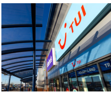
TUI TUI offers unforgettable holidays with expertly curated destinations, seamless booking, and exceptional service every step of the way. IG: @tuiuk