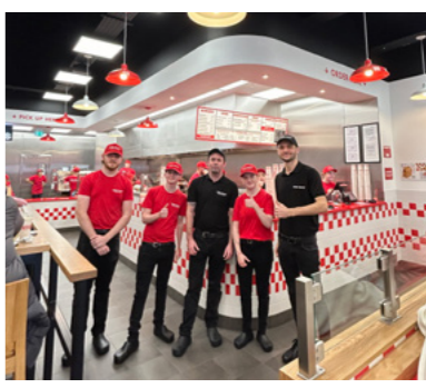
Five Guys Fresh, customisable burgers with hand cut fries, and don't forget about their infamous shakes. Perfect for a quick bite. IG: @fiveguysuk