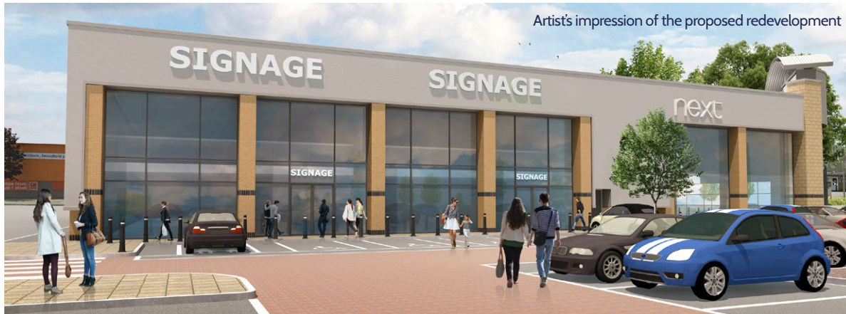
Artist's impression of the proposed redevelopment