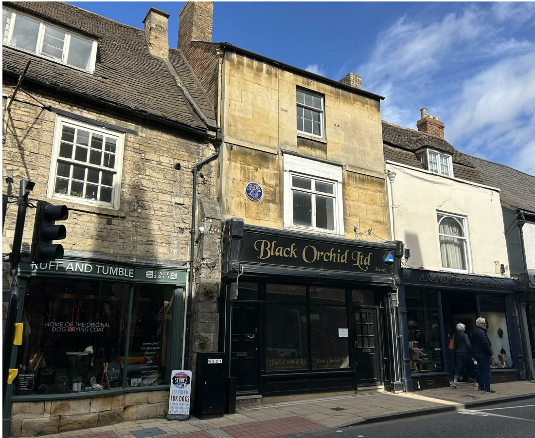
Interior photos to come