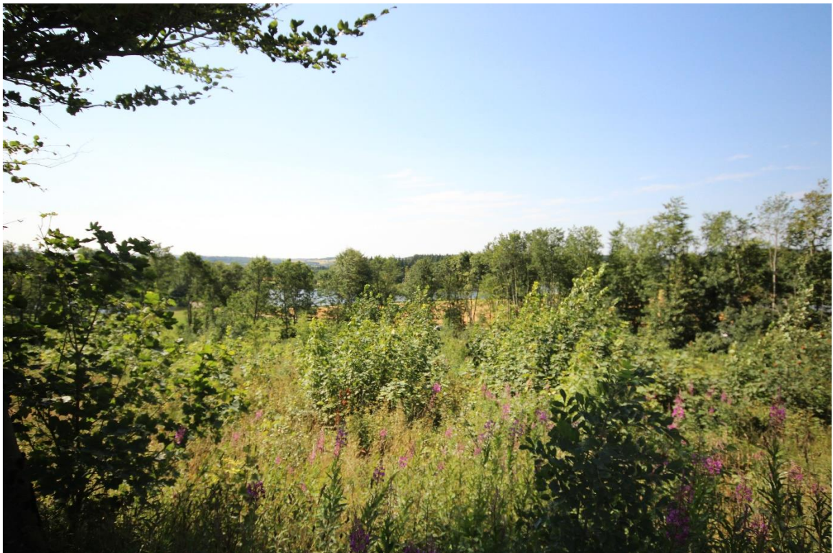
View of woodland with Pitfour Lake in the background through the trees