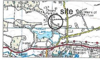
Location Plan :