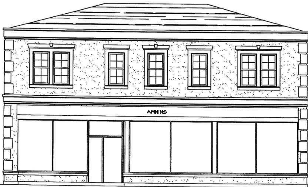
FRONT ELEVATION - EFIS FINISH