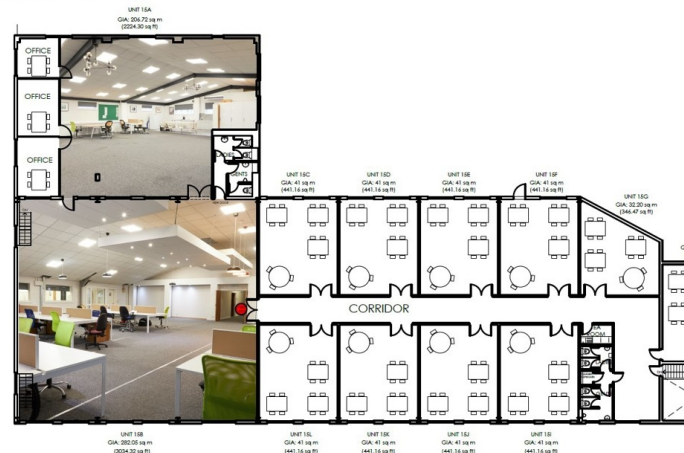
Floor Plan showing current layout