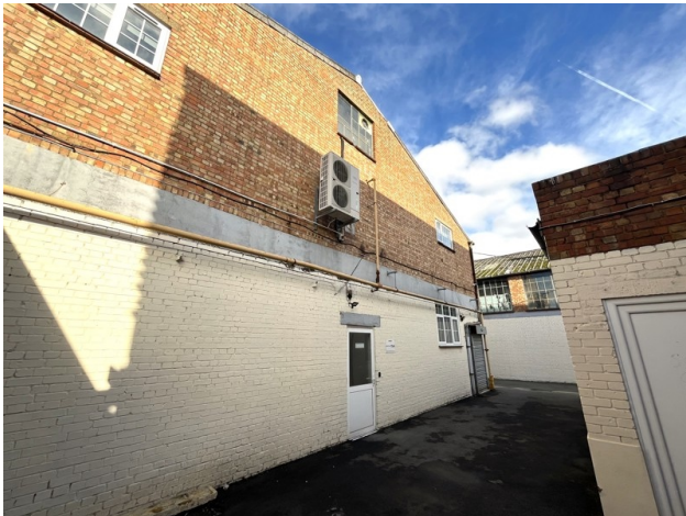
Ground Floor Entrance