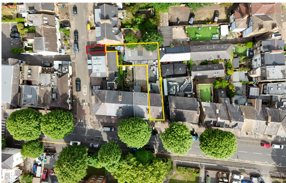
Yellow area delineates the freehold demise Red area delineates rights of way secured