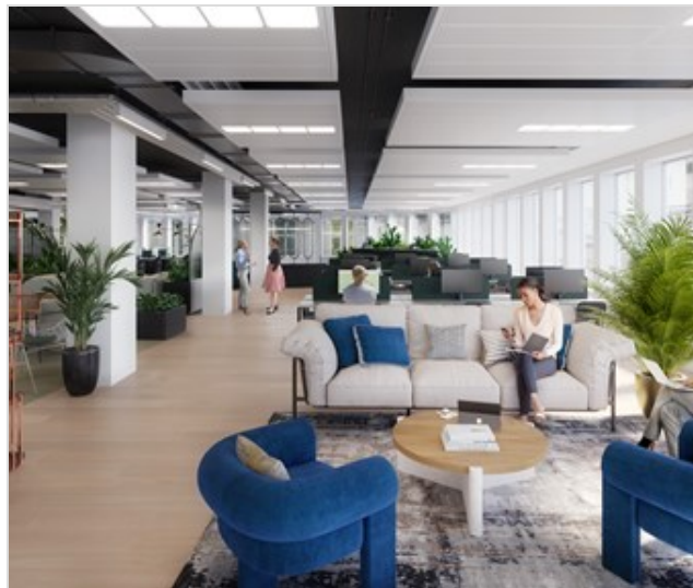
62 Threadneedle Street, London, EC2R 8HP