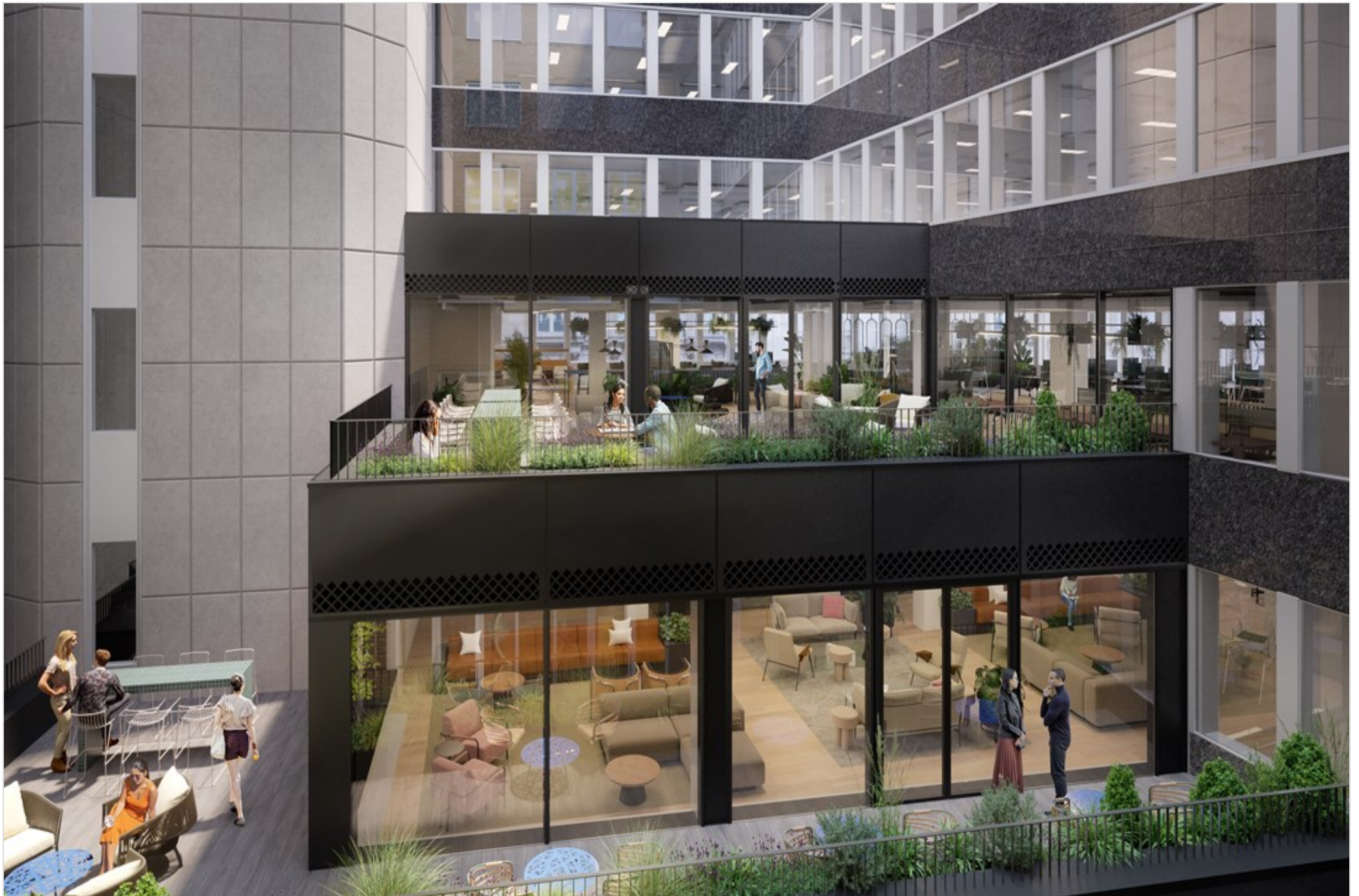
62 Threadneedle Street, London, EC2R 8HP