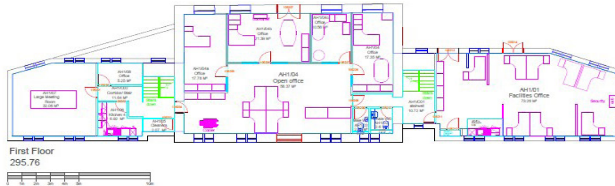
First Floor 295.76