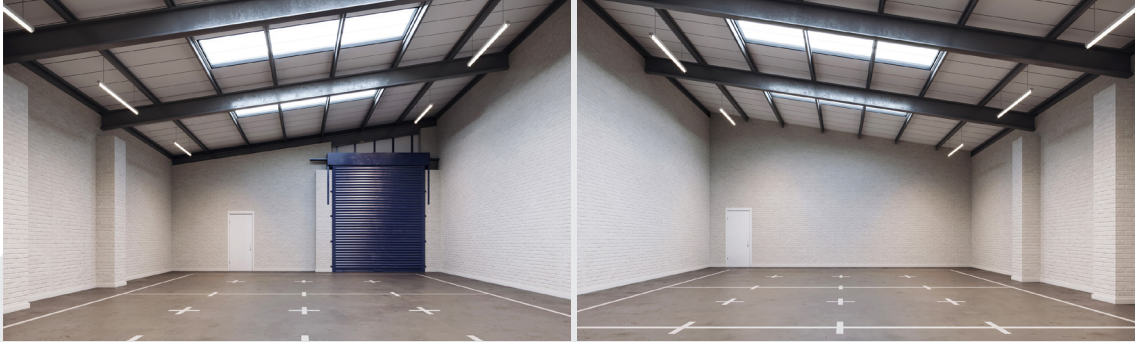
Typical Single Unit

Stafford Road, Wolverhampton, West Midlands, WV10 6HH