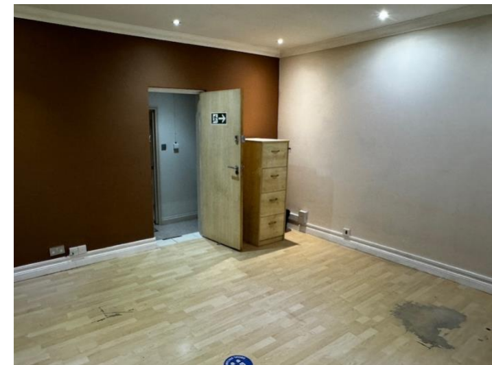
Connaught House, Broomhill Road, Woodford Green IG8 0XR Tel: 020 8506 9900

Countrywide and their Clients give notice that: No property information constitutes part of an offer or a contract and must not be relied upon as a statement or representation of fact. The information is a general outline only and is for the guidance of prospective purchasers or tenants. No guarantee is given as the accuracy of any description, dimensions, reference to condition or otherwise and purchasers or tenants must rely on their own enquiries by inspection or otherwise on all matters including planning and other consents. Countrywide, its Clients, employees and agents will not be responsible for any loss, howsoever arising from the use or reliance on these particulars or information.