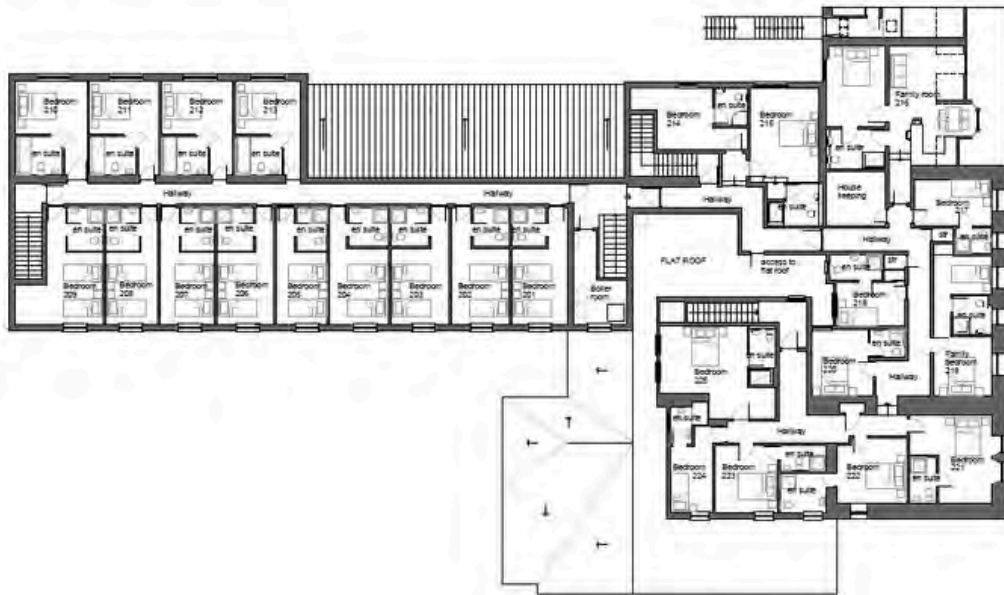
FIRST FLOOR PLAN 1:100