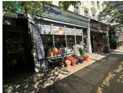
5 Victoria Road - Hardware Shop