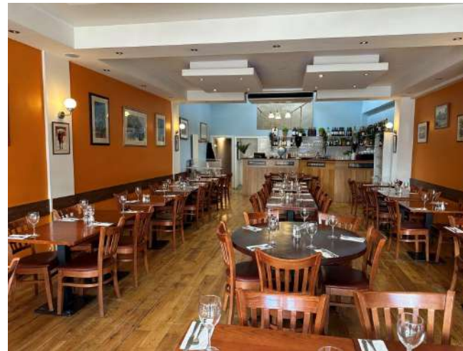
4 Victoria Road - Restaurant