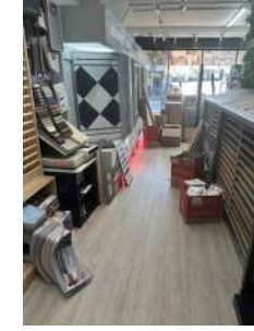
5 Victoria Road - Hardware Shop