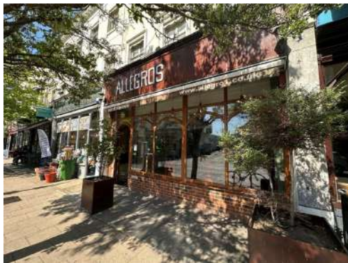
4 Victoria Road - Restaurant

We are instructed to seek offers in excess of £1,575,000 (One Million Five Hundred and Seventy-Five Thousand Pounds) subject to contract and exclusive of VAT.