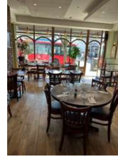
4 Victoria Road - Restaurant