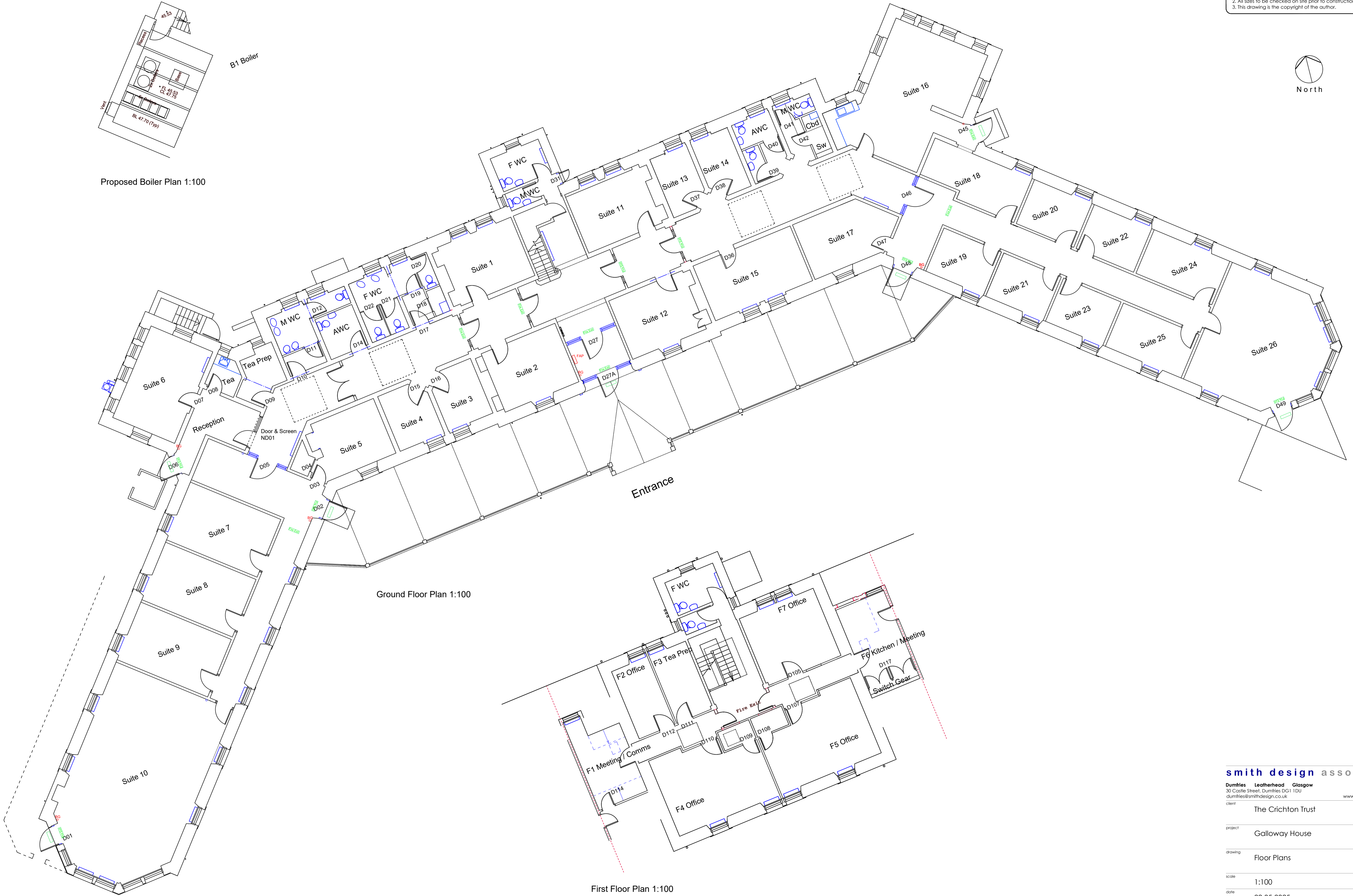
Ground Floor Plan 1:100