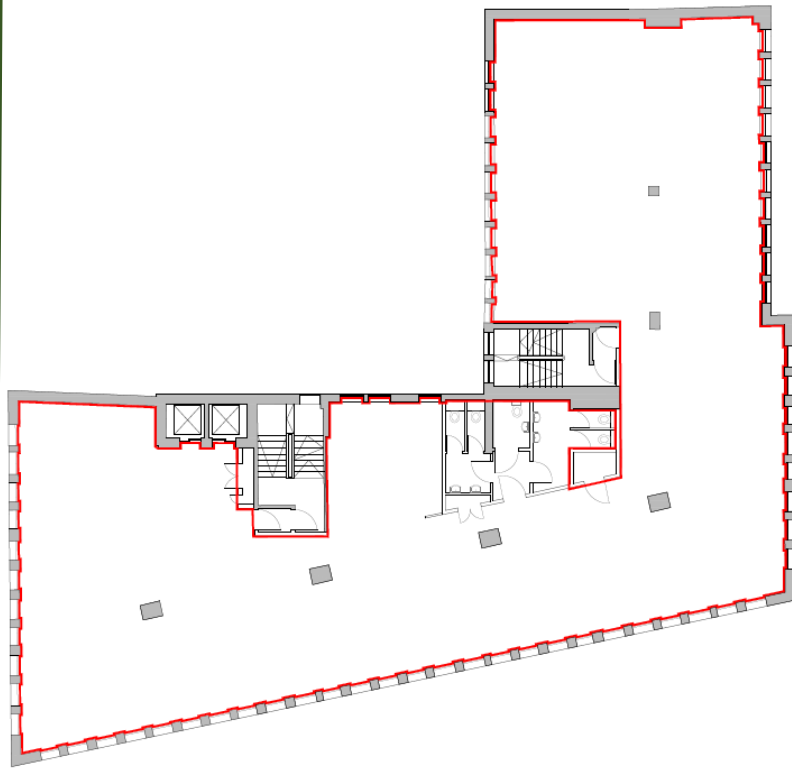
1 st floor plan – Virtual tour here