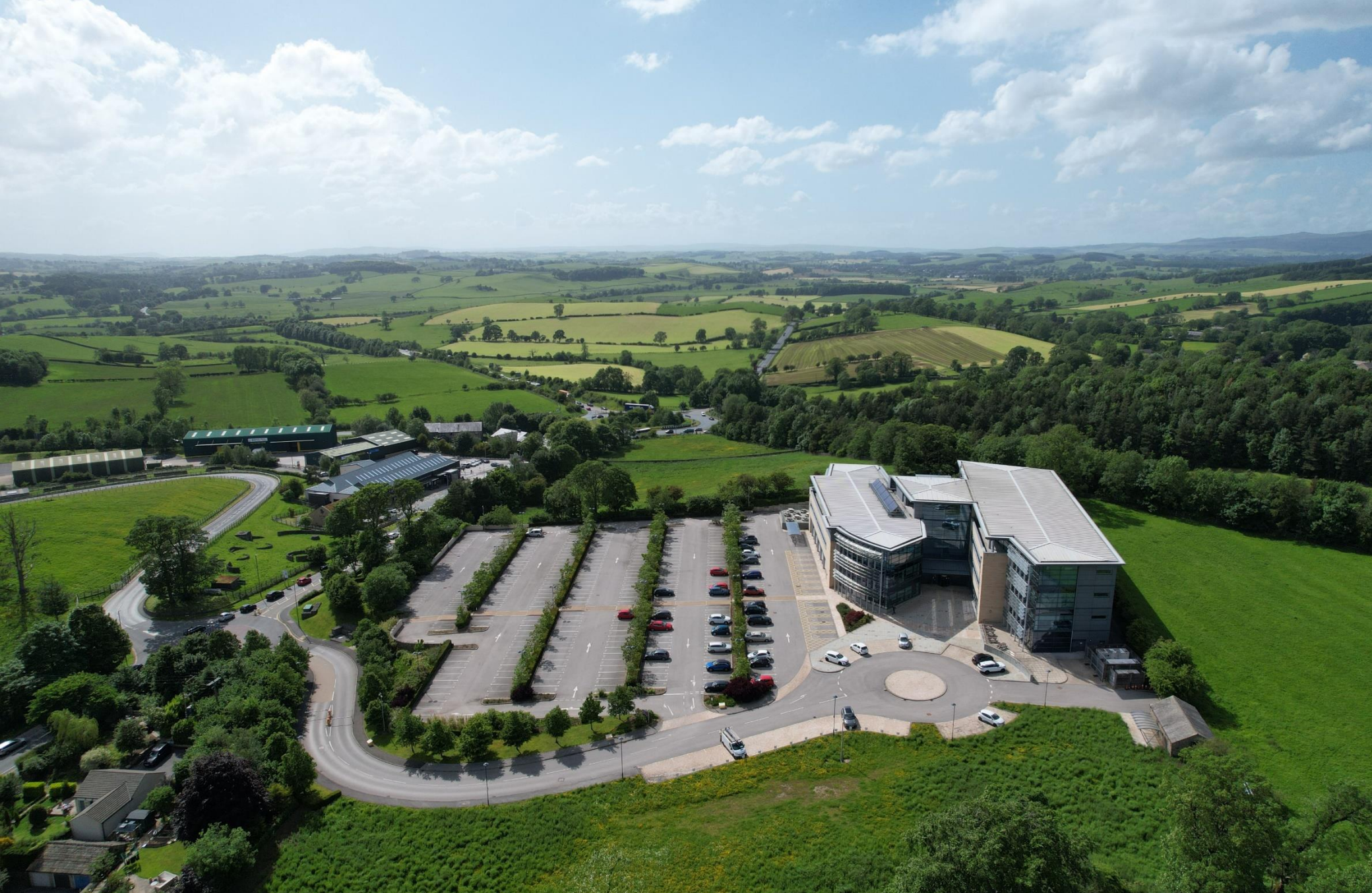
Gateway House | Gargrave Road | Skipton | BD23 1UD