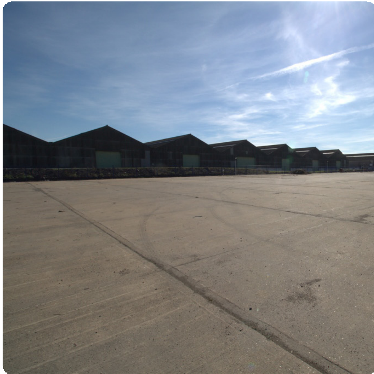
Yard 25 Meon Vale Business Park, Stratford-upon-avon, CV37 8QR