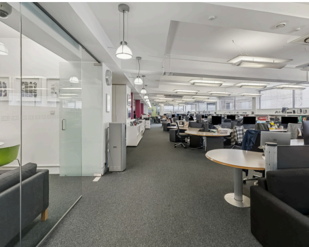
OFFICE & MEETING SPACE