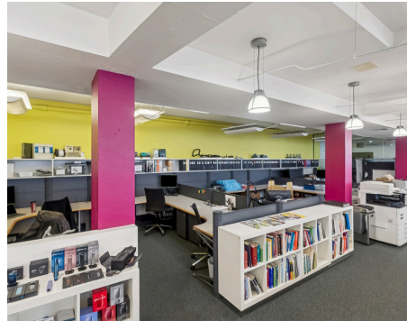
OPEN PLAN OFFICES