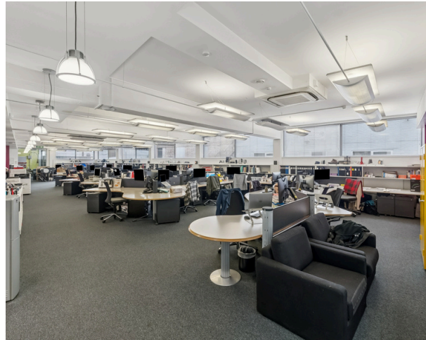
OPEN PLAN OFFICE