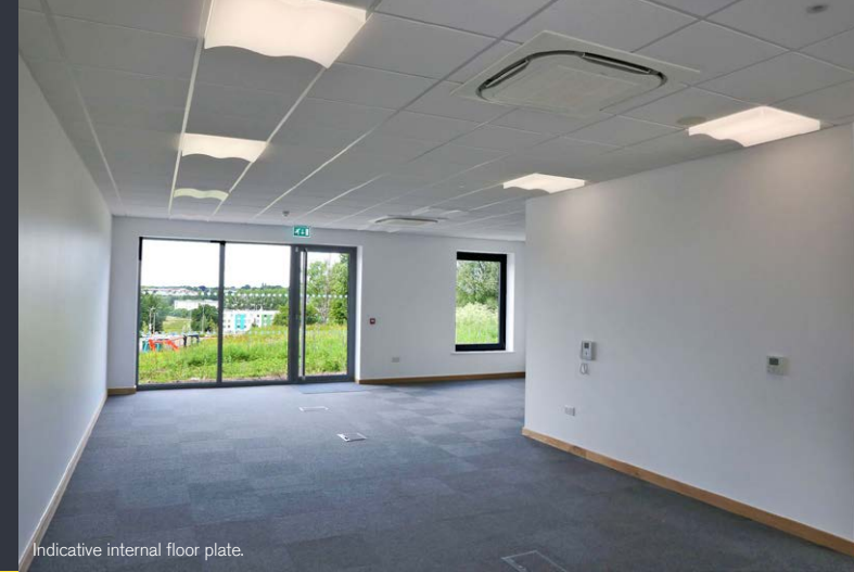
Indicative internal floor plate.

Comprising a modern self-contained two storey terraced building completed in 2019, the accommodation is built to an exceptional institutional standard including full access raised floors, lift, CCTV, 24hour security, comfort cooling, kitchen and WC facilities. Car parking spaces are provided in parking groves.