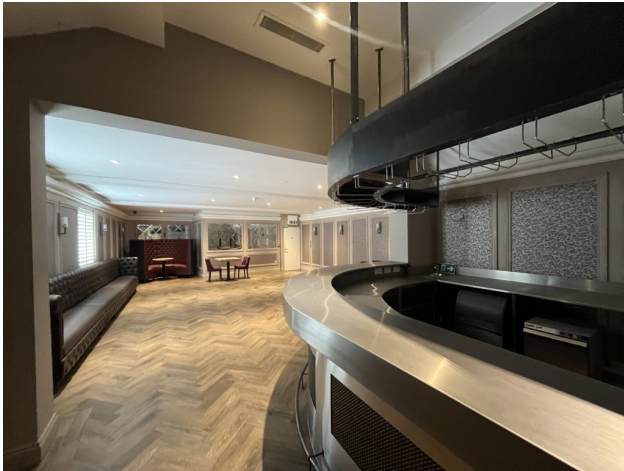
First floor seating