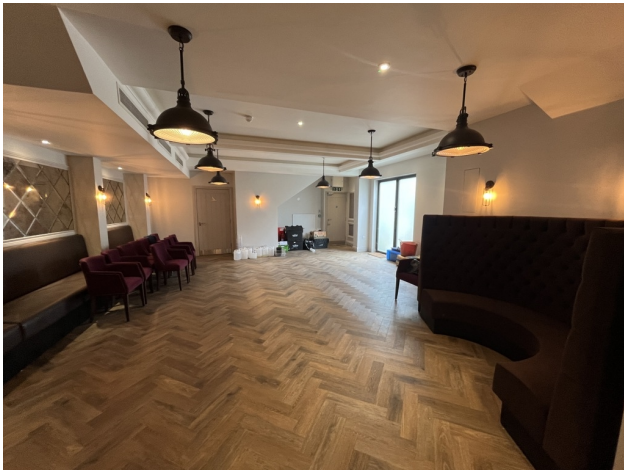
Ground floor seating