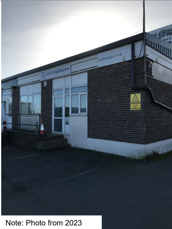
Note: Photo from 2023