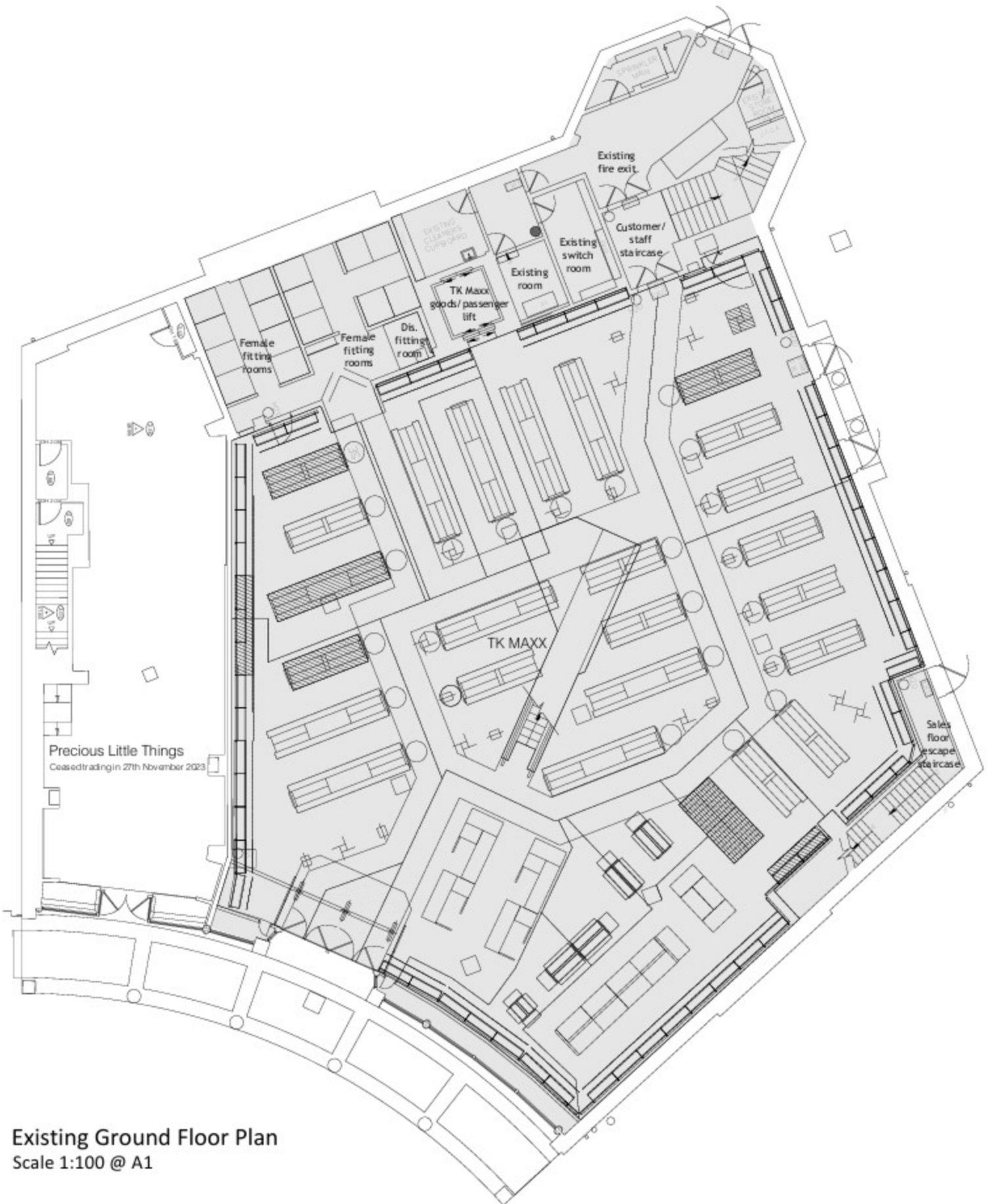
Existing Ground Floor Plan Scale 1:100 @ A1