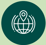
YOUNG, INTERNATIONAL AND AFFLUENT RESIDENTIAL CATCHMENT