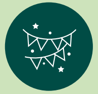
EXTENSIVE EVENTS PROGRAMME