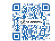
Our Park Code