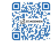
Our Building Code

HIGH SPECIFICATION OFFICE AND RECEPTION SPACES