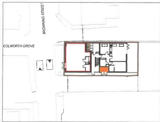
SITE PLAN scale 1:500 @ A3