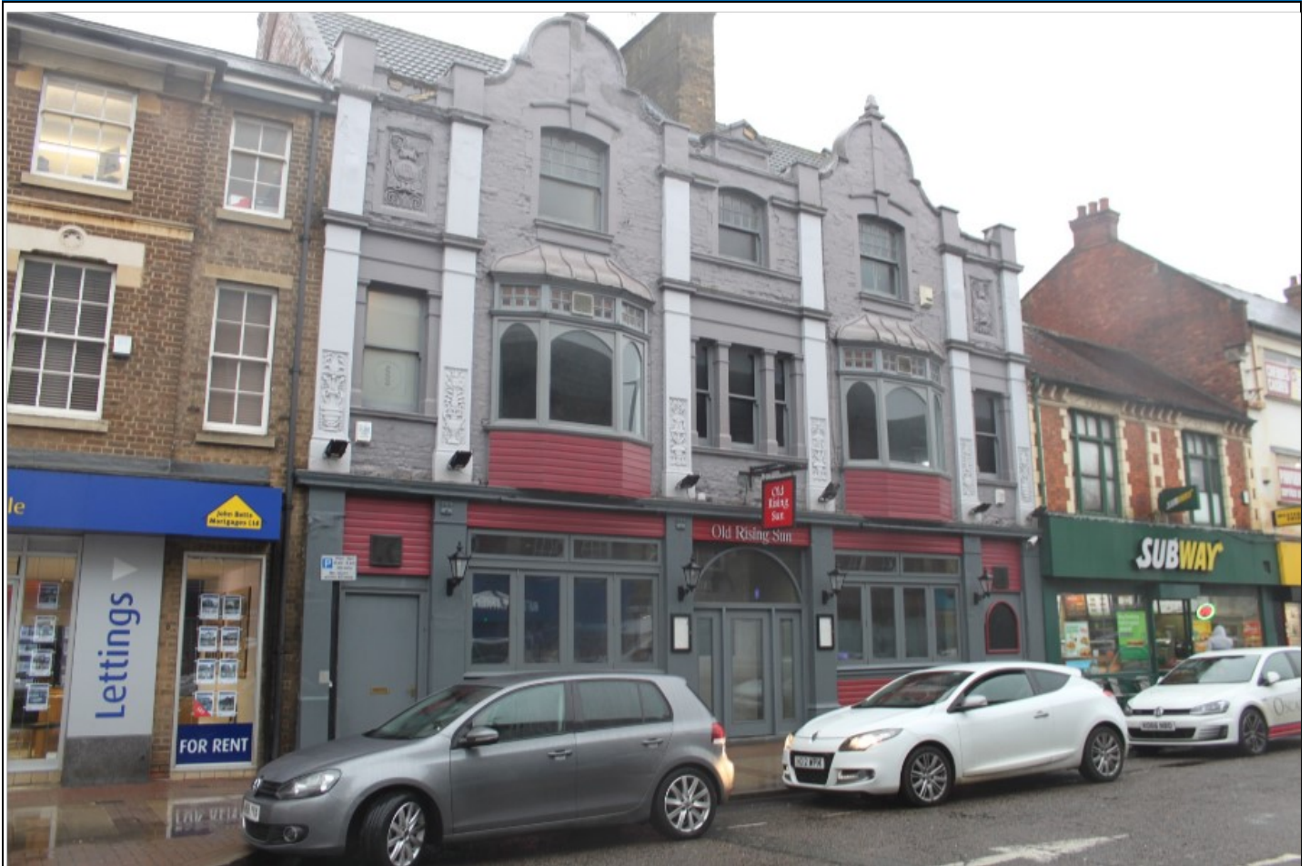
Old Rising Sun, 3 Silver Street, Kettering, Kettering, NN16 0BN

Rental Offers Invited for New Nil Premium, Free of Tie Lease