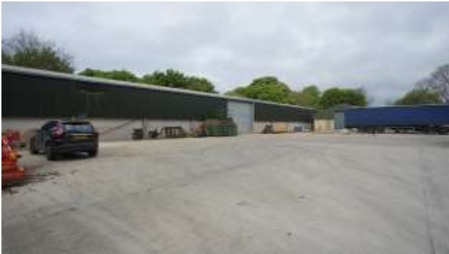
Front yard and parking area