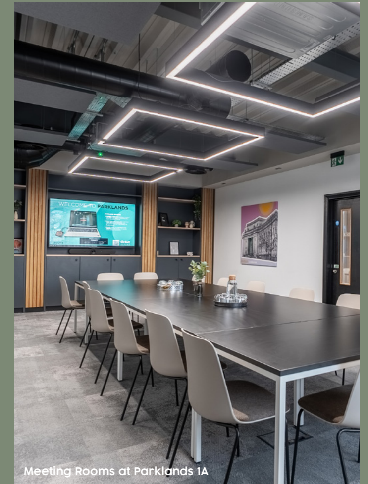
Meeting Rooms at Parklands 1A