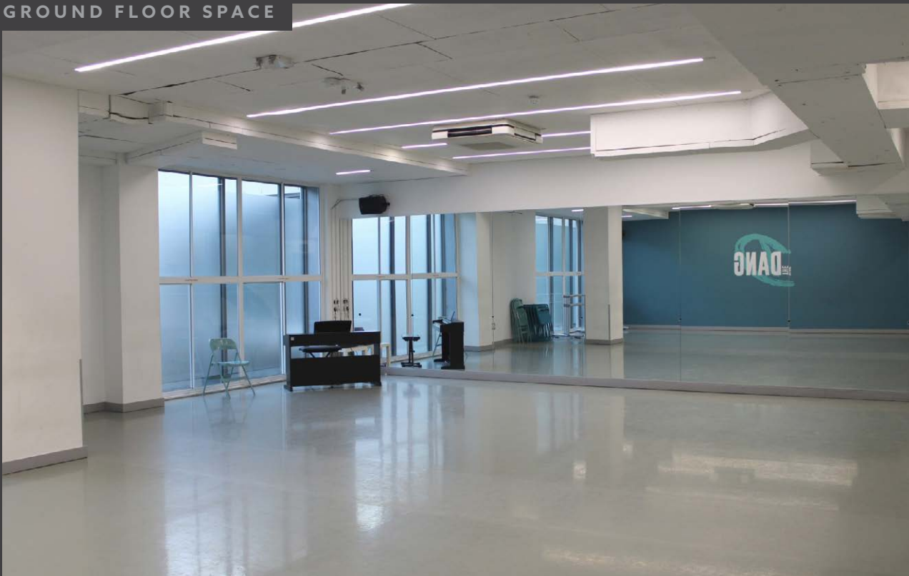
GROUND FLOOR SPACE