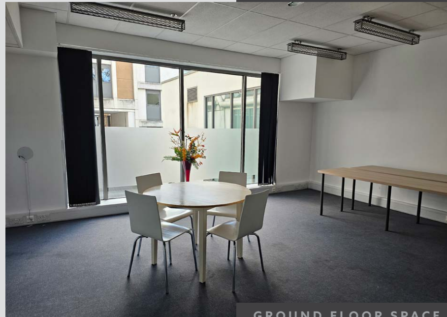
GROUND FLOOR SPACE