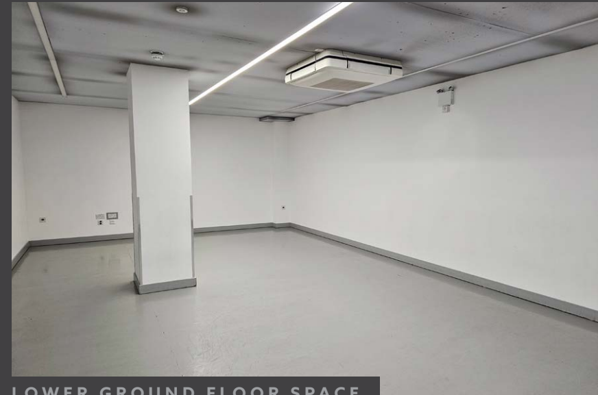
LOWER GROUND FLOOR SPACE