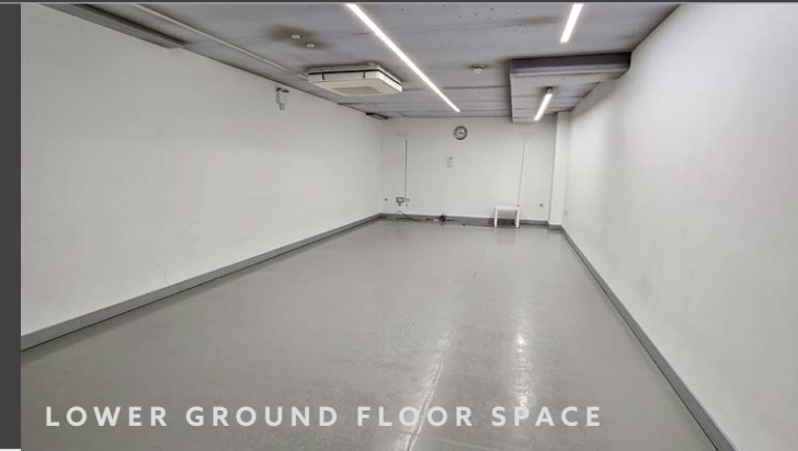
LOWER GROUND FLOOR SPACE

The ground and basement levels offer a combined 14,552 ft 2 (1,352 m 2 ) of space, including expertly designed areas for large studios, offices, and meeting rooms, all with high levels of natural light, air-conditioning, and security features. The landlord has invested in significant internal upgrades to create an adaptable fluid layout.