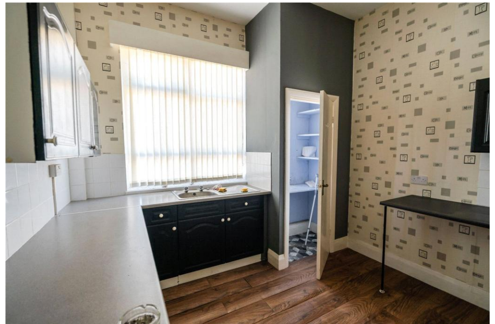
The Smokers Arms, Albion Street, Grimsby, DN32 7DX