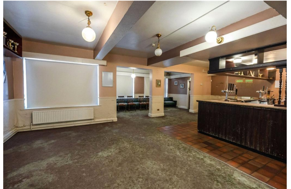
The Smokers Arms, Albion Street, Grimsby, DN32 7DX