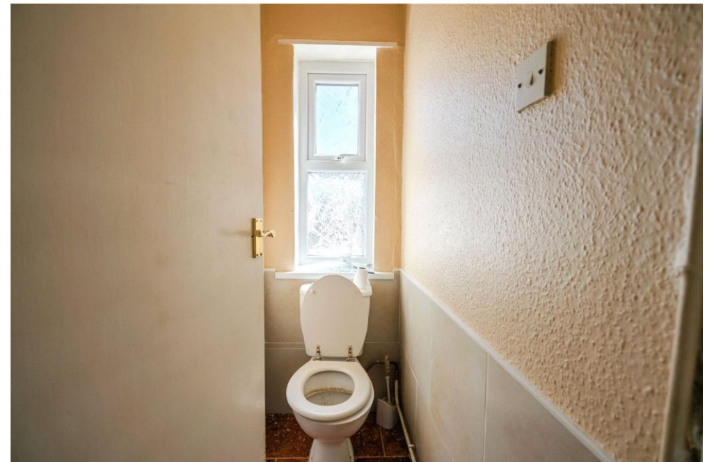
The Smokers Arms, Albion Street, Grimsby, DN32 7DX