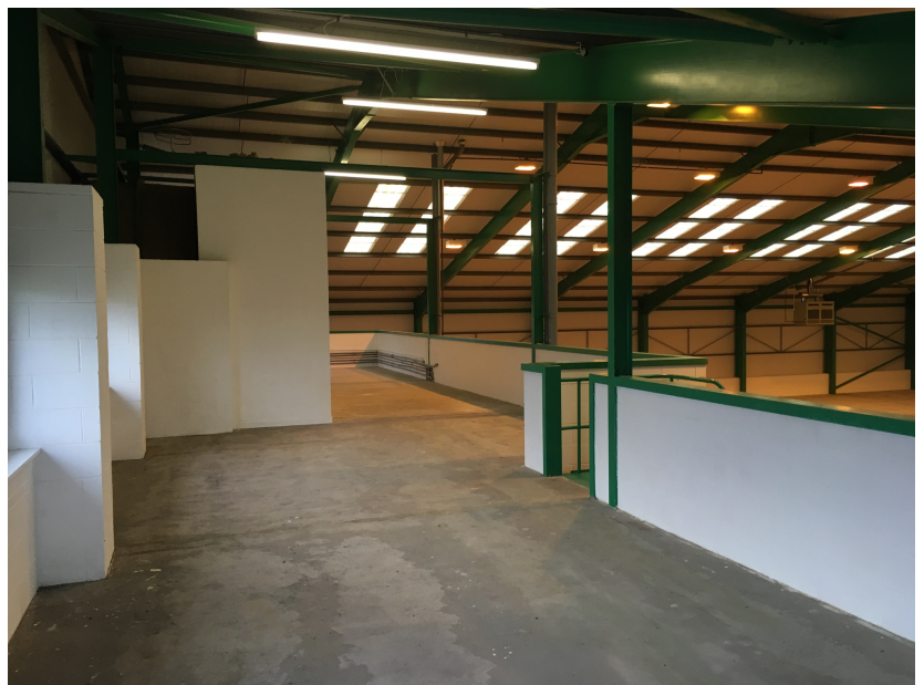
UNIT 1 MEZZANINE