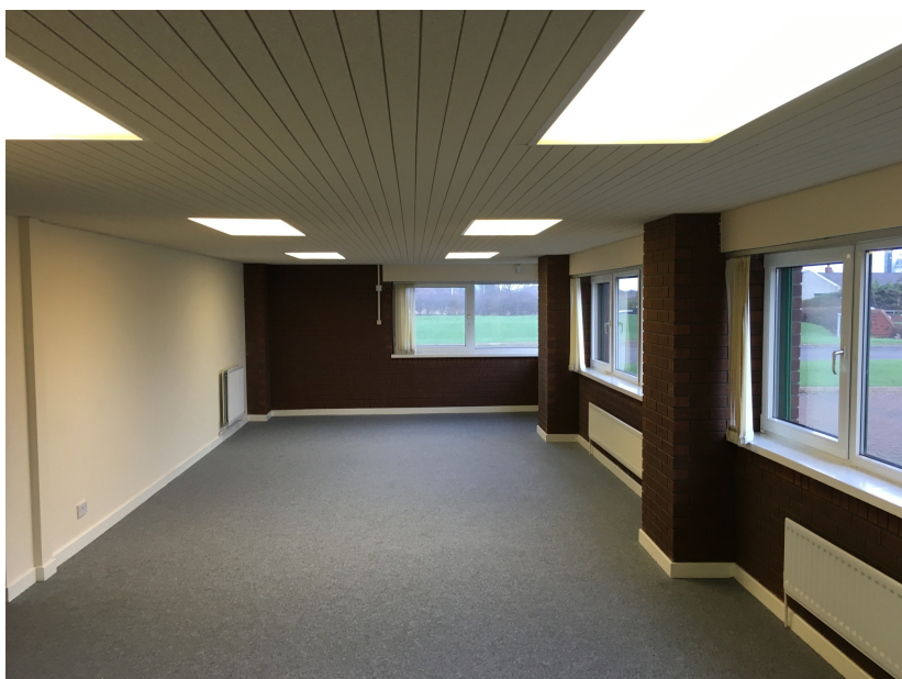
UNIT 1 GROUND FLOOR OFFICES