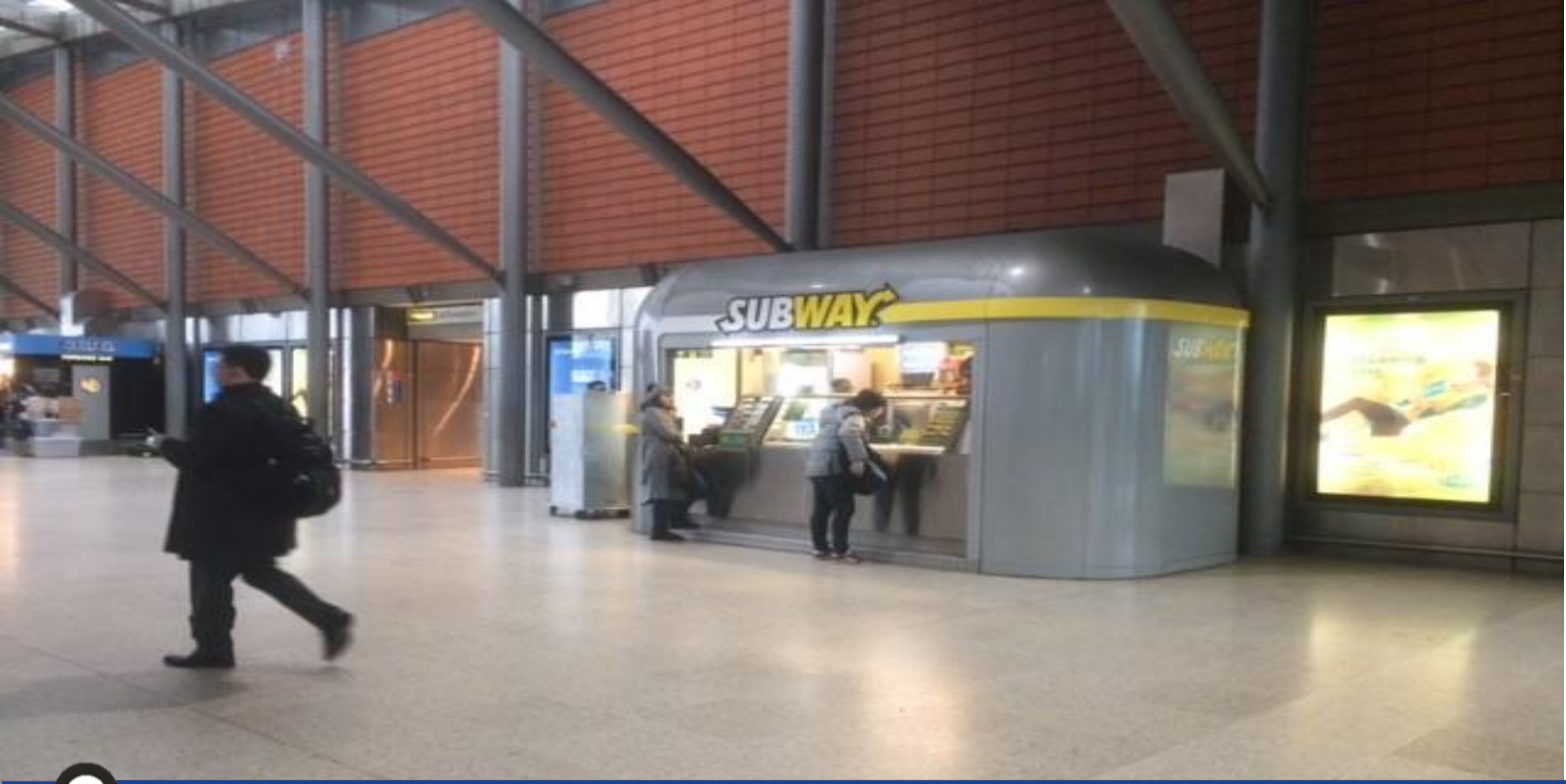
Kiosk – North Greenwich Station