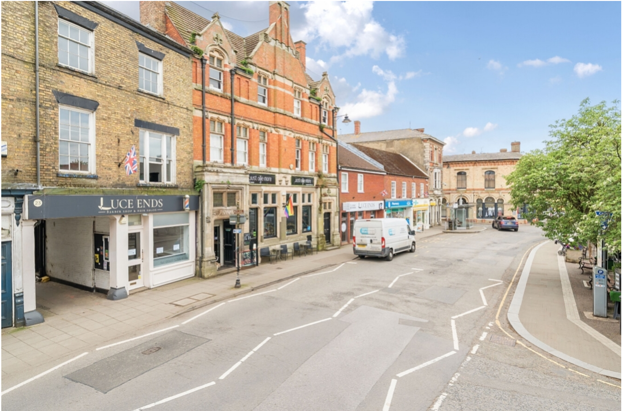
23 High Street, Horncastle, Lincolnshire, LN9 5HP