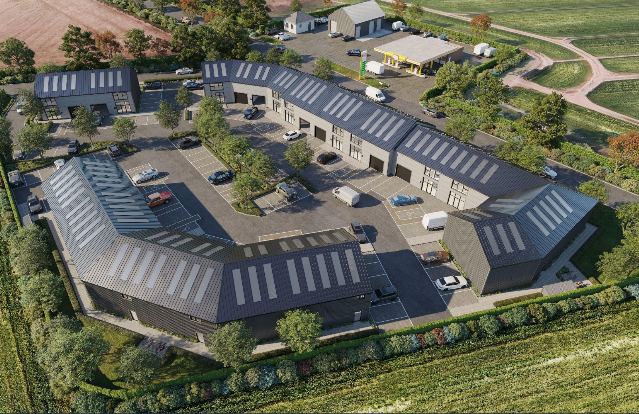
Aerial CGI of Apollo Business Parks at Souldorp | 14 NEW BUILD FREEHOLD COMMERCIAL UNITS