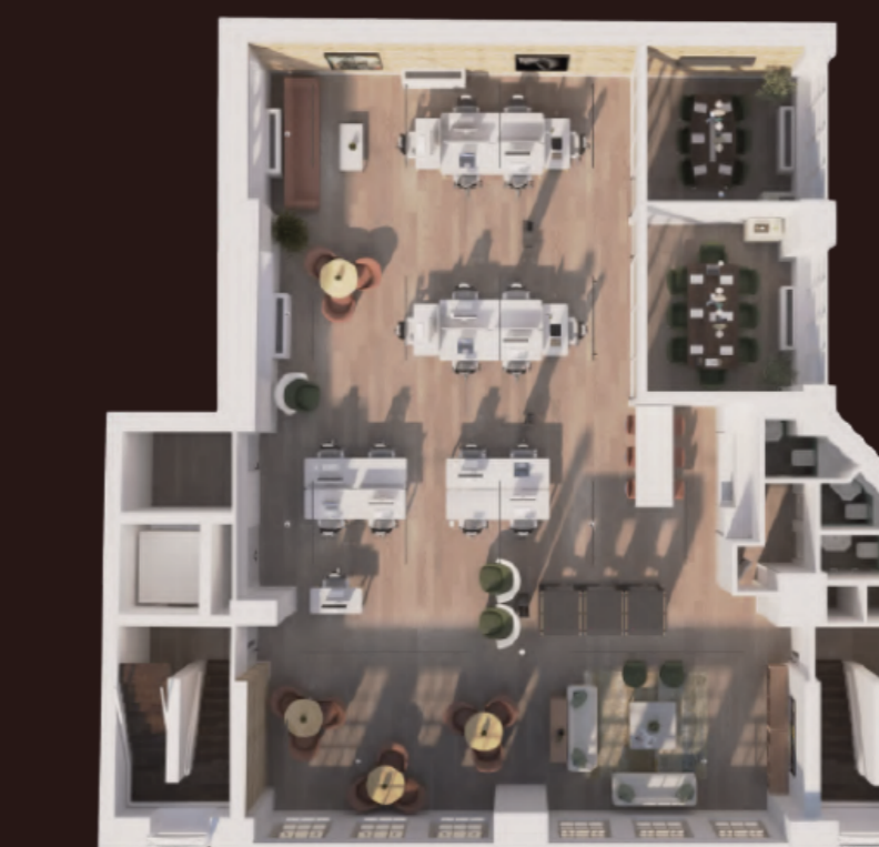
FIRST, SECOND AND THIRD FLOOR