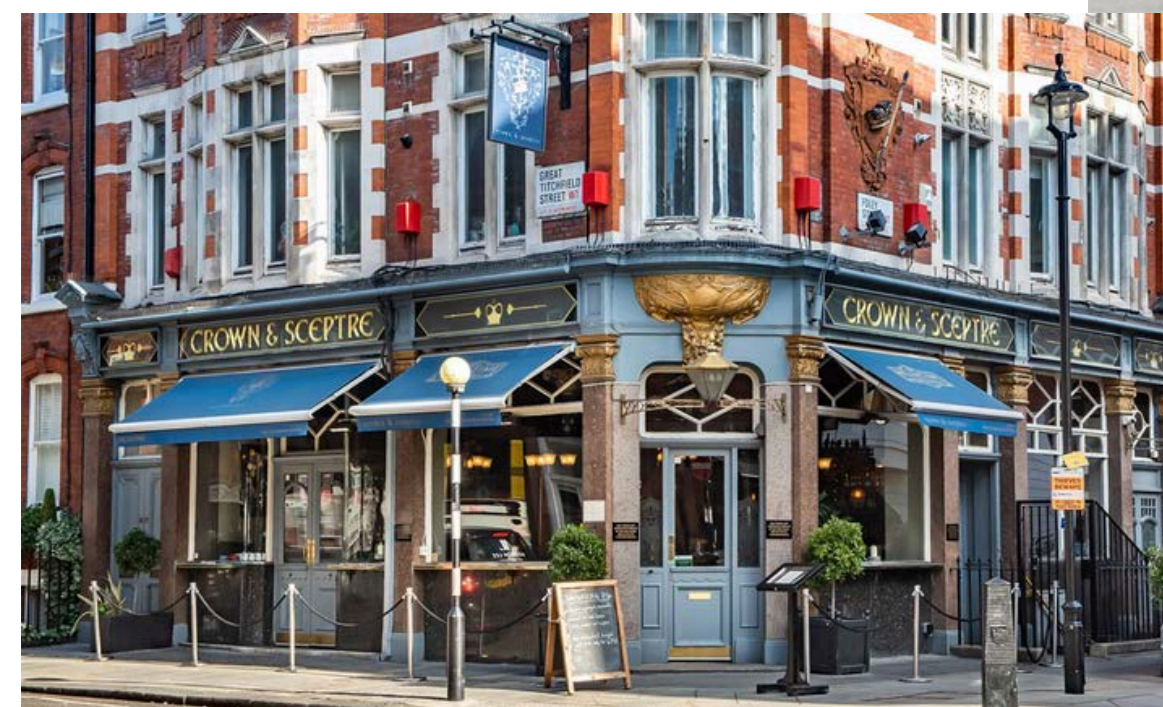
Crown & Sceptre Pub