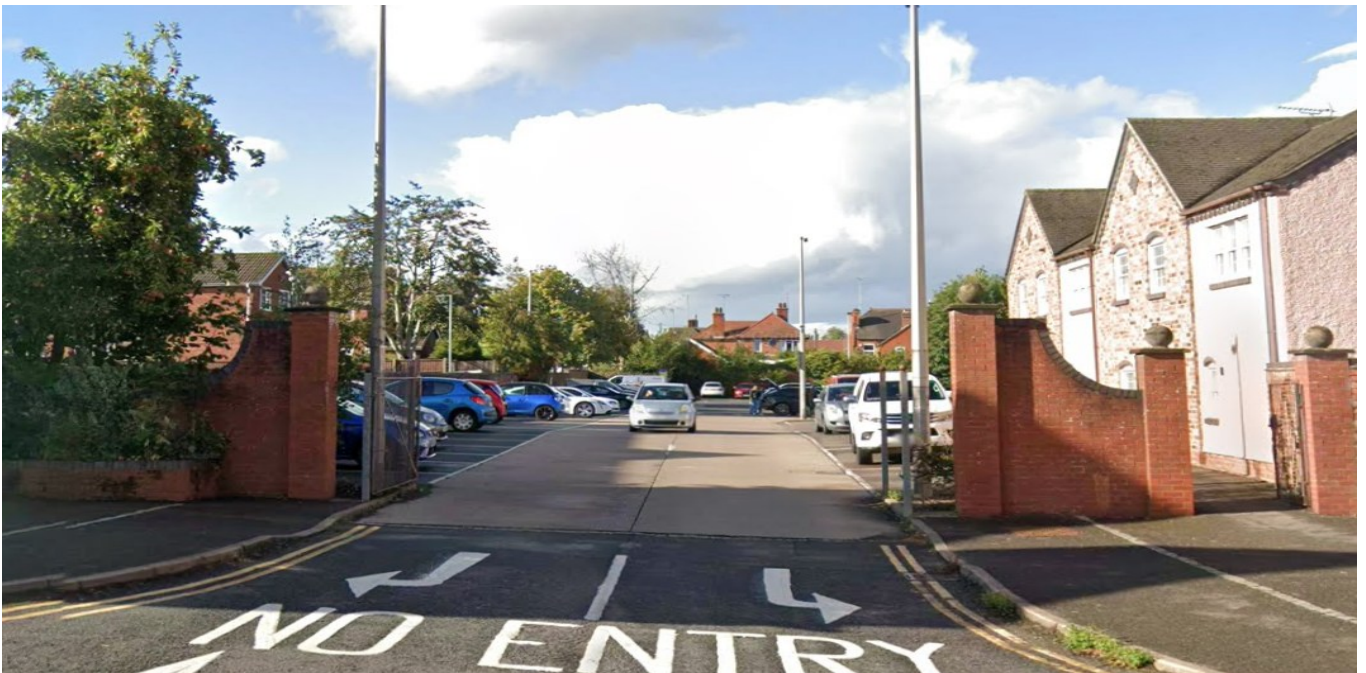
Egress from car park onto Kilwardby Street