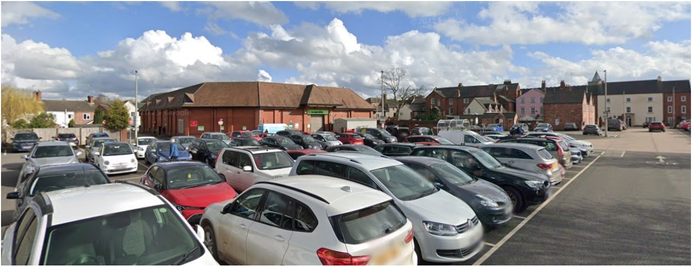
Rear of store and Parking