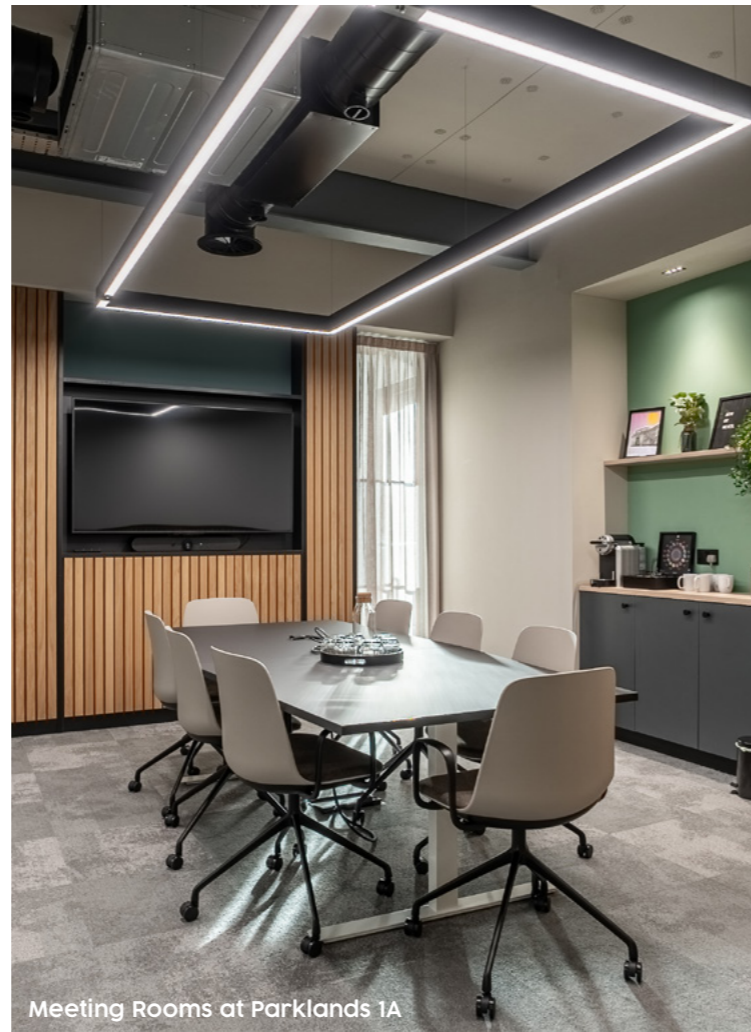
Meeting Rooms at Parklands 1A