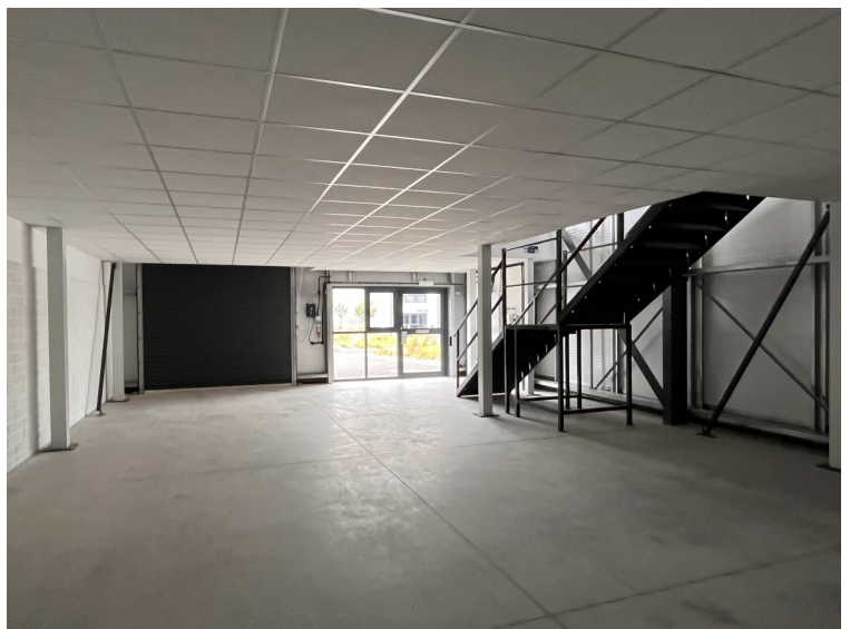
Ground floor prior to fit-out