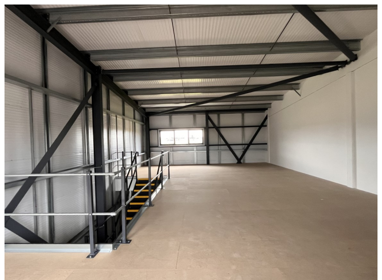
First floor level prior to fit-out