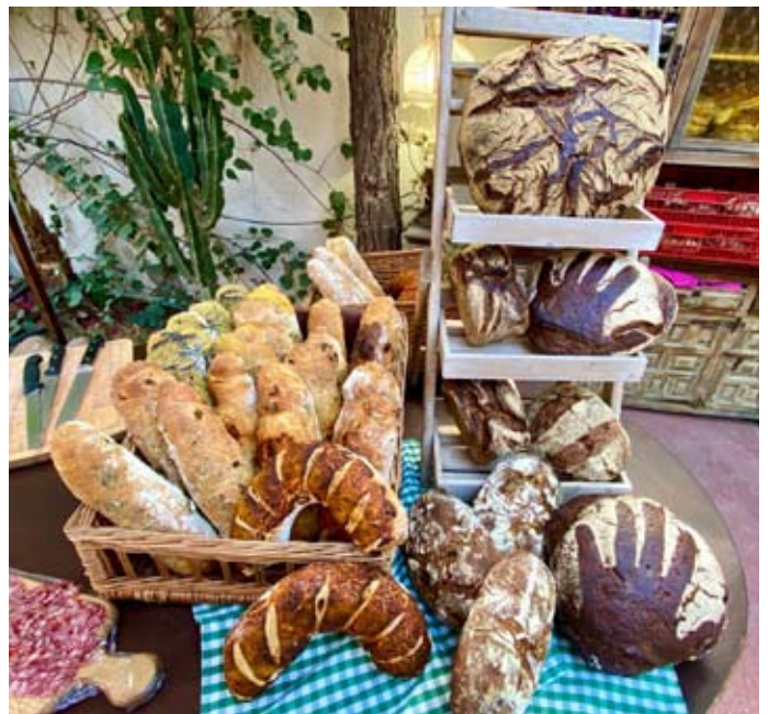
Successful country bakery