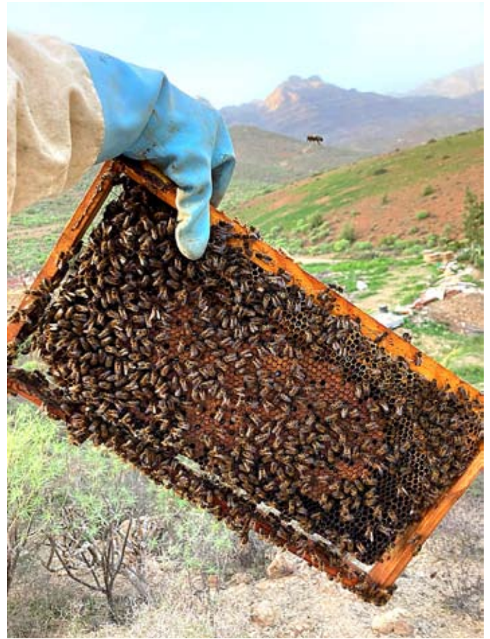
Honey from our bees