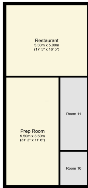
First Floor Floor area 68.6 sq.m. (738 sq.ft.)