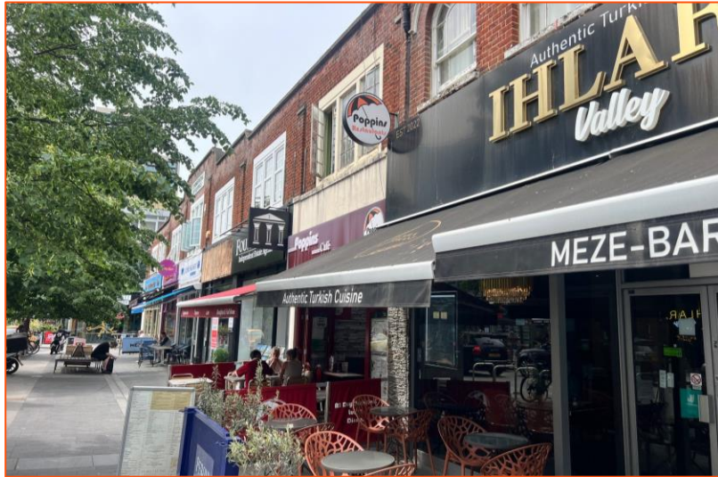
75 Commercial Way looking west