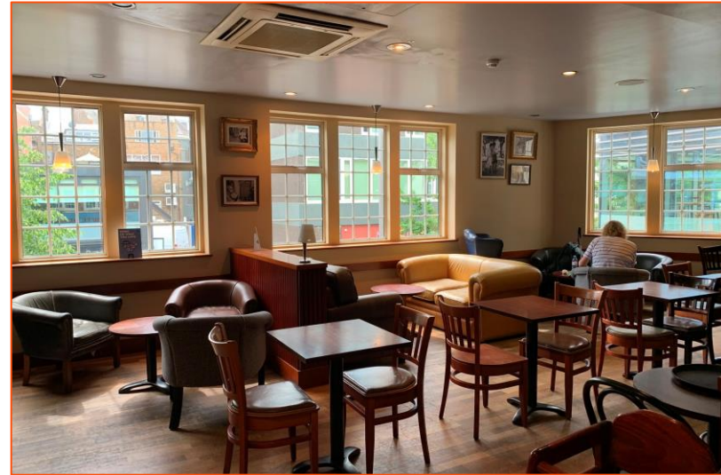
63 Commercial Way, 1 st floor Trading