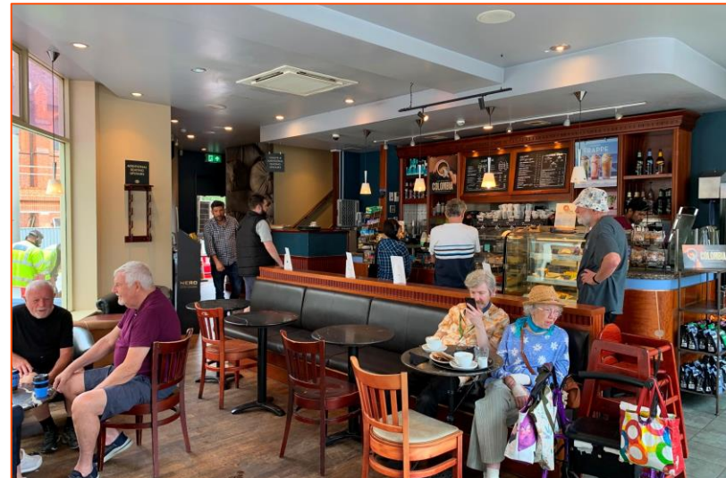
63 Commercial Way – Ground Floor