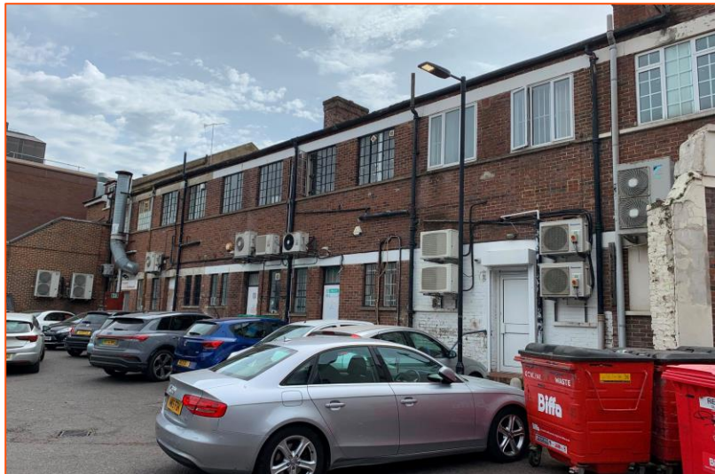
Rear of 63-75 Commercial Way